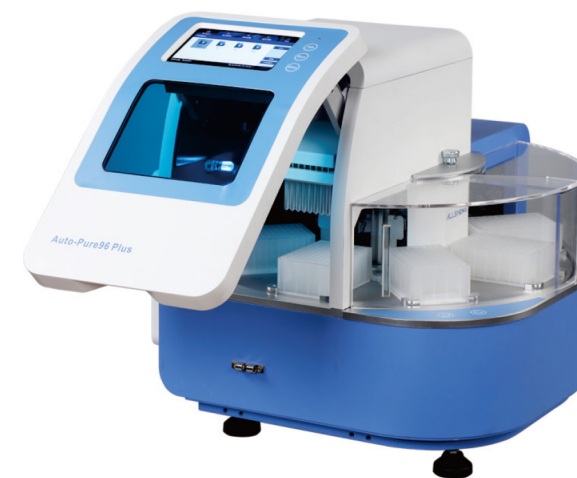
With openable carbon door