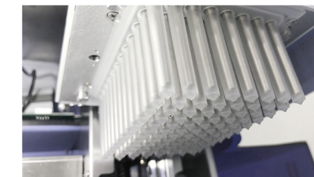
Patent structure of magnetic rod sleeve loading and unloading, more stable and reliable.