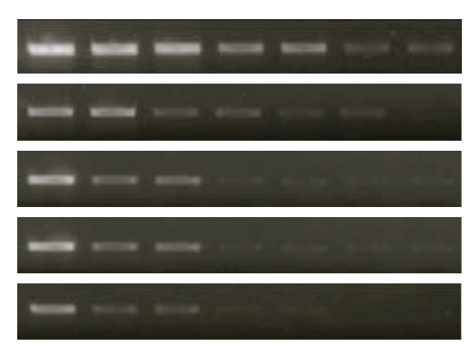
Figure 1. Mouse tail DNA rapid extraction comparison

PCRBIO Rapid Extract PCR Kit was used to extract DNA from 3mg of mouse tail clipping following the standard 15 minute protocol. The extraction was repeated using equivalent extraction kits from alternative manufacturers. A serial three-fold dilution series was made from each supernatant. PCRBIO H5 Taq Mix Red was used to amplify a 1kb fragment of mouse GAPDH gene from each dilution. Results were compared by agarose gel electrophoresis. Row 1 shows results from PCR Biosystems, row 2 from Kapa Biosystems, row 3 from Bioline, row 4 from Sigma and row 5 from Fermentas.